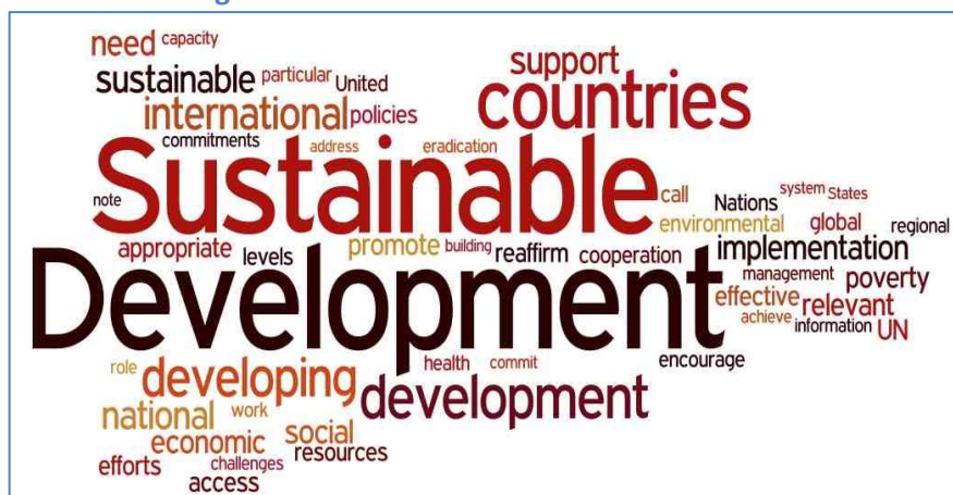
Figure 1: Final Outcome Document word cloud

The content of the zero draft was slightly different as can be seen in the ‘word-cloud’ below. In this case, the figure also shows the fifty most frequently used words in the text. Again, ‘sustainable development’ is the most used expression in the text. Mostly the same as for the final outcome document happens for the words ‘countries’, ‘development’ and ‘developing’. ‘Implementation’ is again very prominent. ‘Economy’ and ‘economic’, which are repeated 50 times altogether, appear then to be very important, showing how the economic pillar receives increasingly more attention than the social and the environmental pillars. The latter two words appear 20 and 17 times, respectively. Then, the word ‘green’ is expressed many times (39 repetitions) like the word ‘sustainable’, which is present 32 times. Very prominent are also ‘support’, ‘poverty’, ‘progress’, and ‘cooperation’.