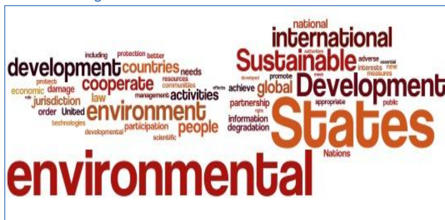
Figure 3: The Rio Declaration 1992 word cloud

A main difference between the Johannesburg Plan of Implementation (2002) and the Rio+20 final outcome document is given by the words like 'support', 'regional', 'resources', 'programmes' and 'implementation' – these are much more prominently used in the Johannesburg text compared to the final outcome document of 2012. Another difference is the higher relevance in the Johannesburg text of the words 'energy', 'management' and 'financial' - words that are not among the 50 most frequently used in the Rio+20 final outcome document.