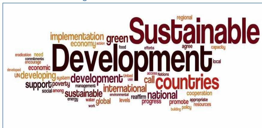
Figure 2: Zero Draft word cloud

With the exception of the word ‘states’, that is the most prominent one in the Rio Declaration 1992 , the main differences to the Final Outcome Document of Rio+20 are to be found especially in the much higher importance given to the word ‘environment’ and ‘environmental’. This might signify that, in 1992, the issues related to environmental degradation and the need to save the ecosystems were much stronger than 20 years later in 2012. This is also in line with the appearance and prominence in the 1992 text of the words ‘degradation’ and ‘damage’. Also very noticeable are the words ‘people’, ‘cooperate’,