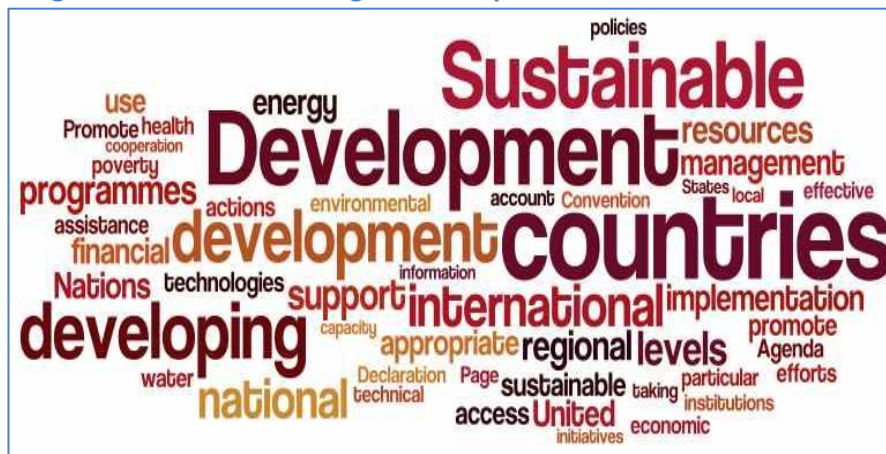
Figure 4: The Johannesburg Plan of Implementation 2002 word cloud

A main difference between the Johannesburg Plan of Implementation (2002) and the Rio+20 final outcome document is given by the words like 'support', 'regional', 'resources', 'programmes' and 'implementation' – these are much more prominently used in the Johannesburg text compared to the final outcome document of 2012. Another difference is the higher relevance in the Johannesburg text of the words 'energy', 'management' and 'financial' - words that are not among the 50 most frequently used in the Rio+20 final outcome document.